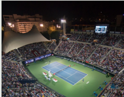
Dubai Tennis Championships

The UAE is home to some of the world's biggest sports events, including the Dubai Rugby 7s, Abu Dhabi Grand Prix, DP World Tour Championship and many more