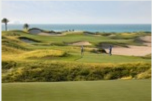
Saadiyat Beach Golf Club 18 holes Championship Course