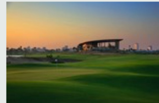
Trump International Golf Club DUBAI Trump International Dubai 18 holes Championship Course