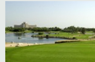
THE RESORT GOLF COURSE DUBAI Jebel Ali Course 9 holes Course