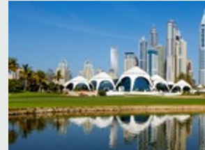
EMIRATES GOLF CLUB DUBAI Majlis Course (Home of the Dubai Desert Classic) Faldo Course (Day and night golf) 18 holes Championship Courses