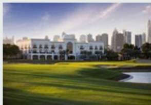
MONTGOMERIE DUBAI Montgomerie Golf Club 18 holes Championship Course