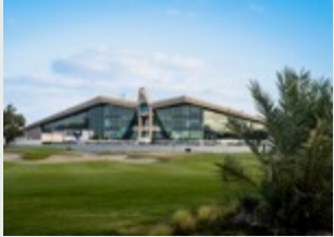
Abu Dhabi Golf Club The National Course (Home of HSBC Championship for 16 consecutive years) 18 holes Championship Course