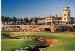
Jumeirah Golf Estates Earth Course (Home of DP World Championship) Fire Course 18 holes Championship Courses