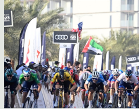
The UAE Tour