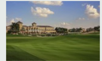
THE ELS CLUB DUBAI SPORTS CITY The Els Club Dubai 18 holes Championship Course