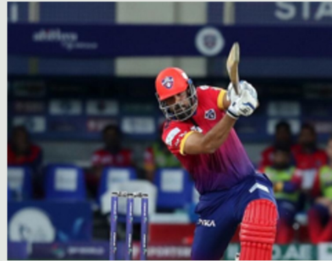
International League T20