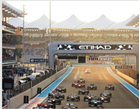
Abu Dhabi Grand Prix