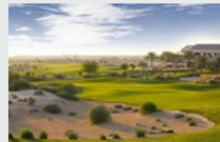
ARABIAN RANCHES GOLF CLUB DUBAI Arabian Ranches Golf Club 18 holes Championship Course