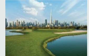
DUBAI HILLS GOLF CLUB Dubai Hills Golf Club 18 holes Championship Course