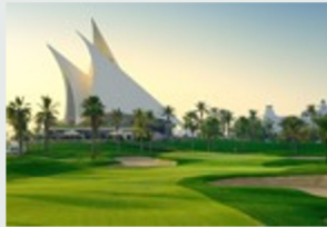
دور دبي DUBAI CREEK Dubai Creek Golf & Yacht Club 18 holes Championship Course