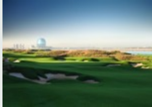
Yas Links Golf Club Home of HSBC Championship 18 holes Championship Course